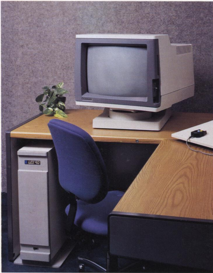
With Lexidata's unique monitor enclosure design, all monitor connections and peripheral power supplies are located in the enclosure's stationary base. The optional freestanding display processor "tower" complements either office, laboratory, or computer room environments.

Enhancing Lexidata's reputation as an innovative industry leader is the availability of a unique, ergonomically-designed monitor enclosure. The enclosure is available with all Lexidata graphics systems including the LEX 90™, Series 2000, Series 3000, and SOLIDVIEW™ product families.